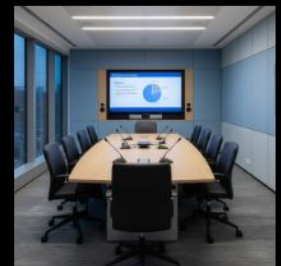
Corporate Conference Rooms