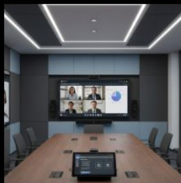
Microsoft Teams Rooms