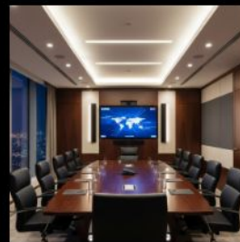
Boardrooms and Executive Suites