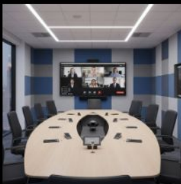
Video Teleconferencing (VTC) Rooms